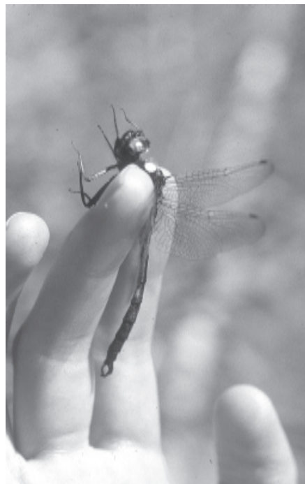
Hine's emerald dragonfly with bee tag.