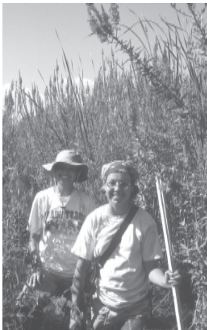
Researchers dwarfed by purple loosestrife plants.

active biological control projects against purple loosestrife, with nearly 2 million agents released and apparent success seen at several sites. However, the national loosestrife biological control program has been criticized as unnecessary. Critics claim purple loosestrife poses little threat to na-