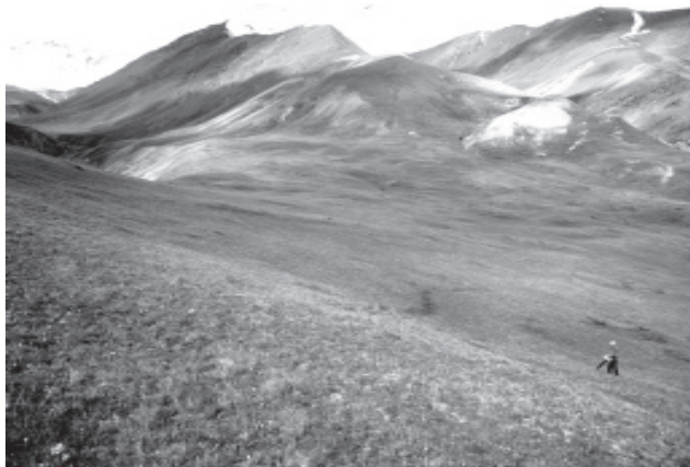
INHS research assistant Dmitry Novikov (lower right) vacuums insects in a mountain meadow in the Trans-Alaj Range of southern Kyrgyzstan.

Despite the importance of grasslands to human civilization, basic knowledge of the grassland biota is still very incomplete. New species, particularly of diverse groups such as