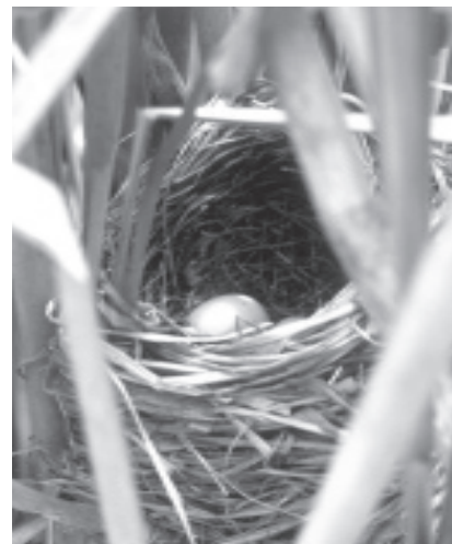
Red-winged Blackbird nest with eggs.

1. Red-winged Blackbirds nesting in purple loosestrife were less likely to succeed