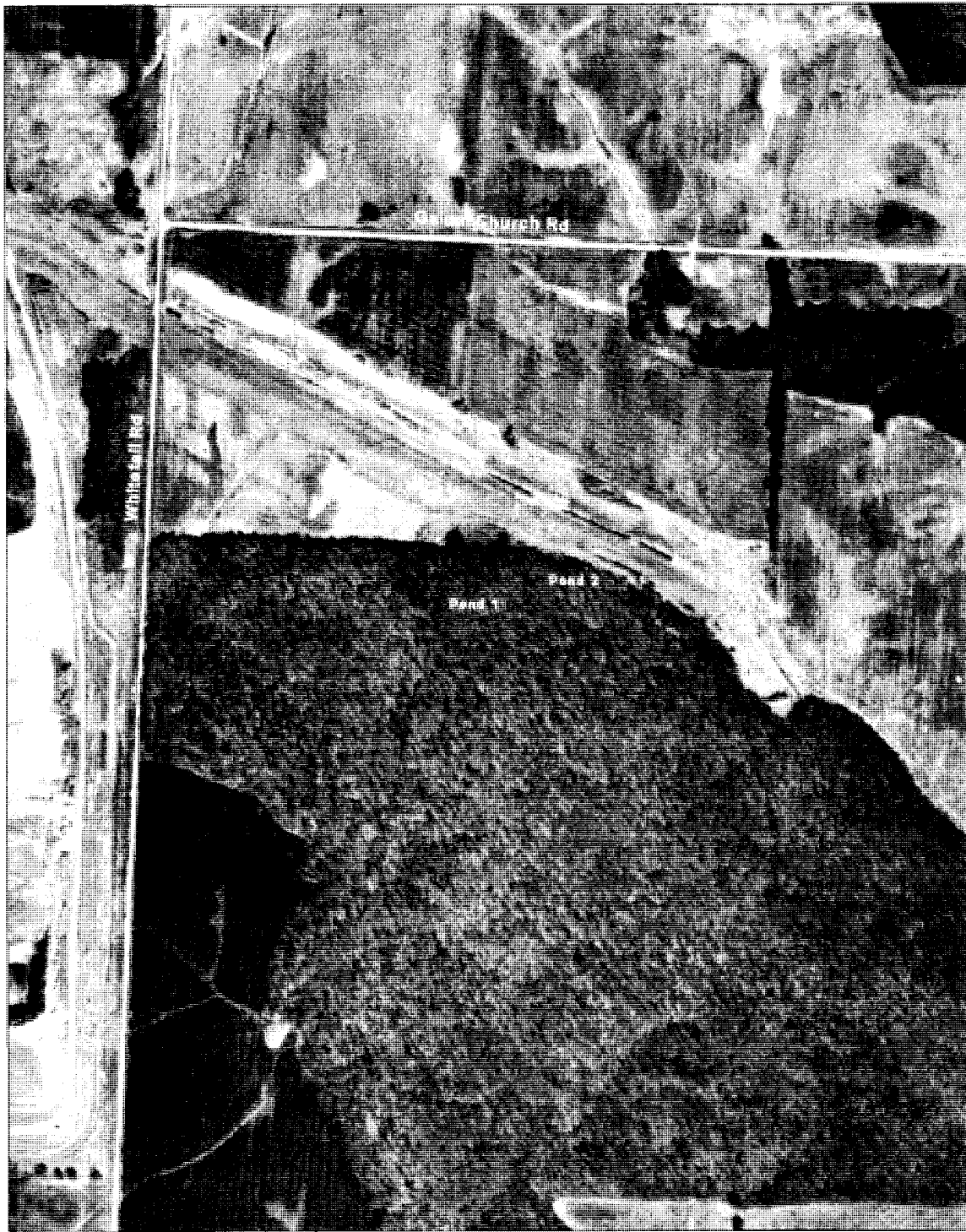
Fig.1 Location of created wetlands at Pyramid State Park, Pery County, IL

formed in a small, pre-existing stream/drainage channel, and Pond 2 is located east-northeast of Pond 1 near