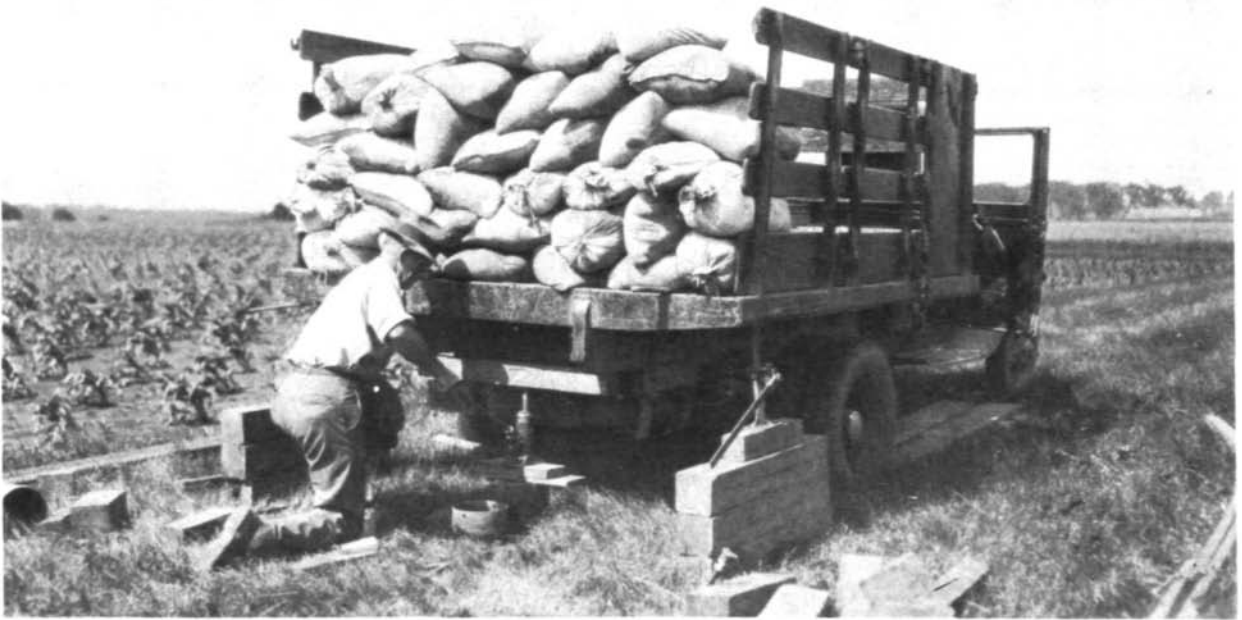
Fig. 1.--Forcing the Cylinders into the Soil.