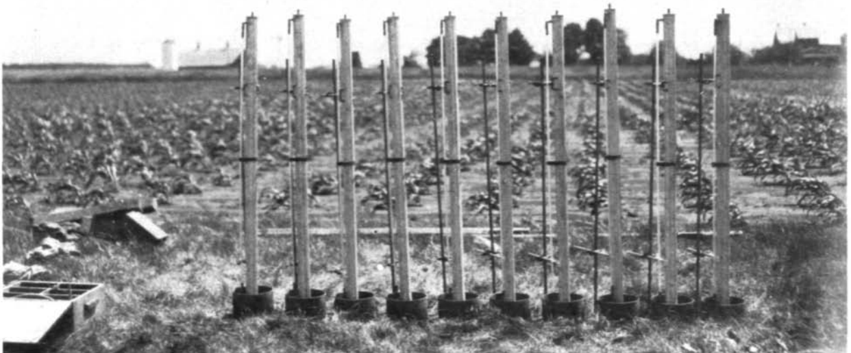
Fig. 2.--Cylinders in Soil and Burettes in Place Ready to Make a Run.