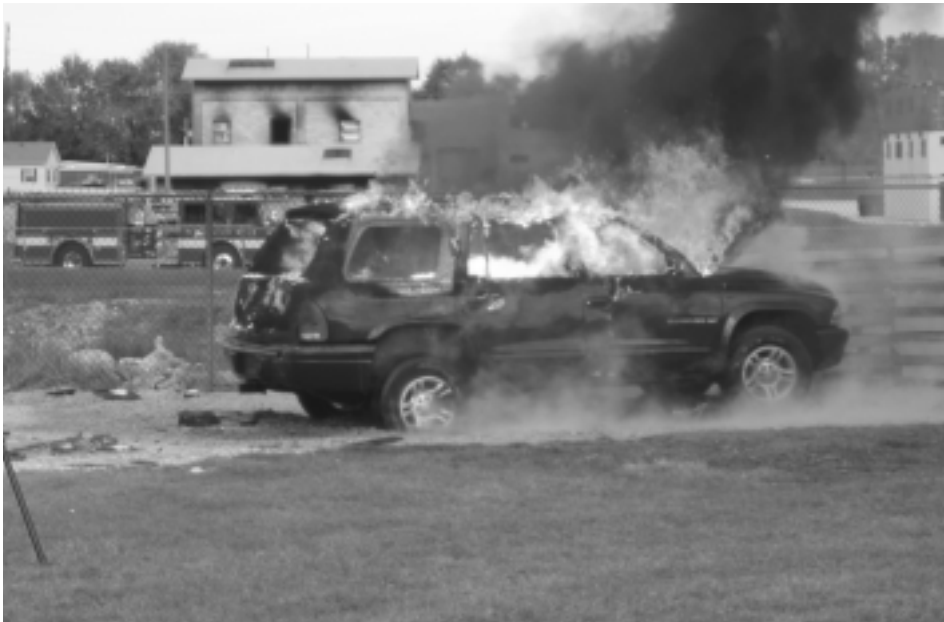
A 2003 SUV was set afire at IFSI to document some of the hazards that firefighters might encounter when dealing with a vehicle fire on a newer model.

Toward the end of last year, the Washington Post published an article about a fire department that had just extinguished a small fire in the floor of a vehicle. The Fire Chief heard two loud explosions that sounded like shotgun blasts. When the Chief returned to the vehicle, he found one firefighter lying unconscious in the front seat of the car and another firefighter wandering around in a daze. The vehicle's front air bags had deployed in their faces. One of the major news networks did an article on the hazards that rescue workers face at accident scenes because of the new safety devices installed on today's vehicles.