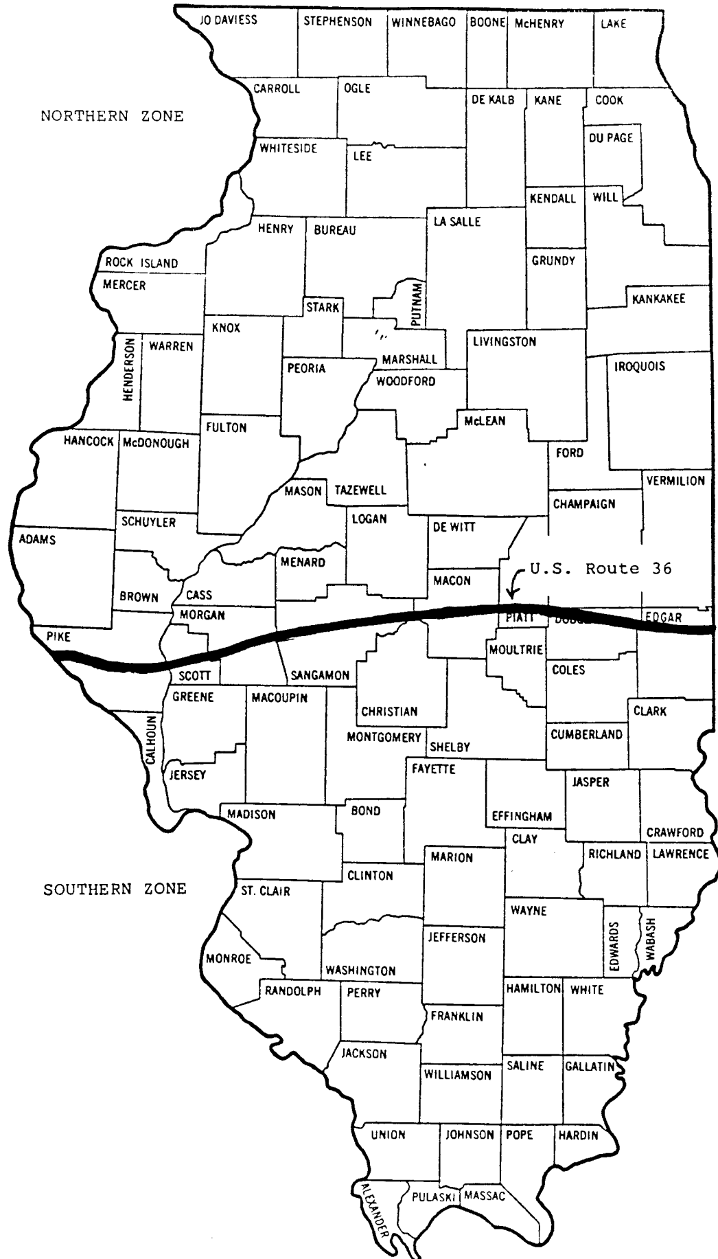
Figure 2. Furbearer management zones for the 1988-89 season.