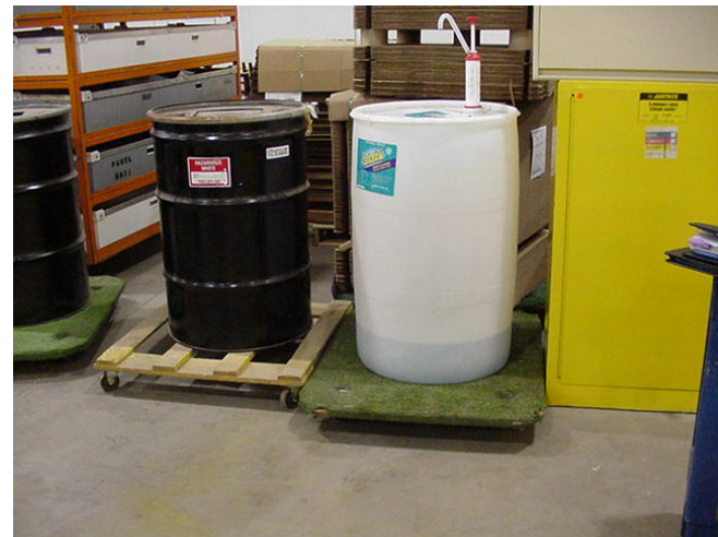
Hazardous waste storage Furniture manufacturer