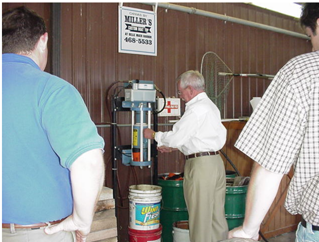
Crushing used oil filters Marina