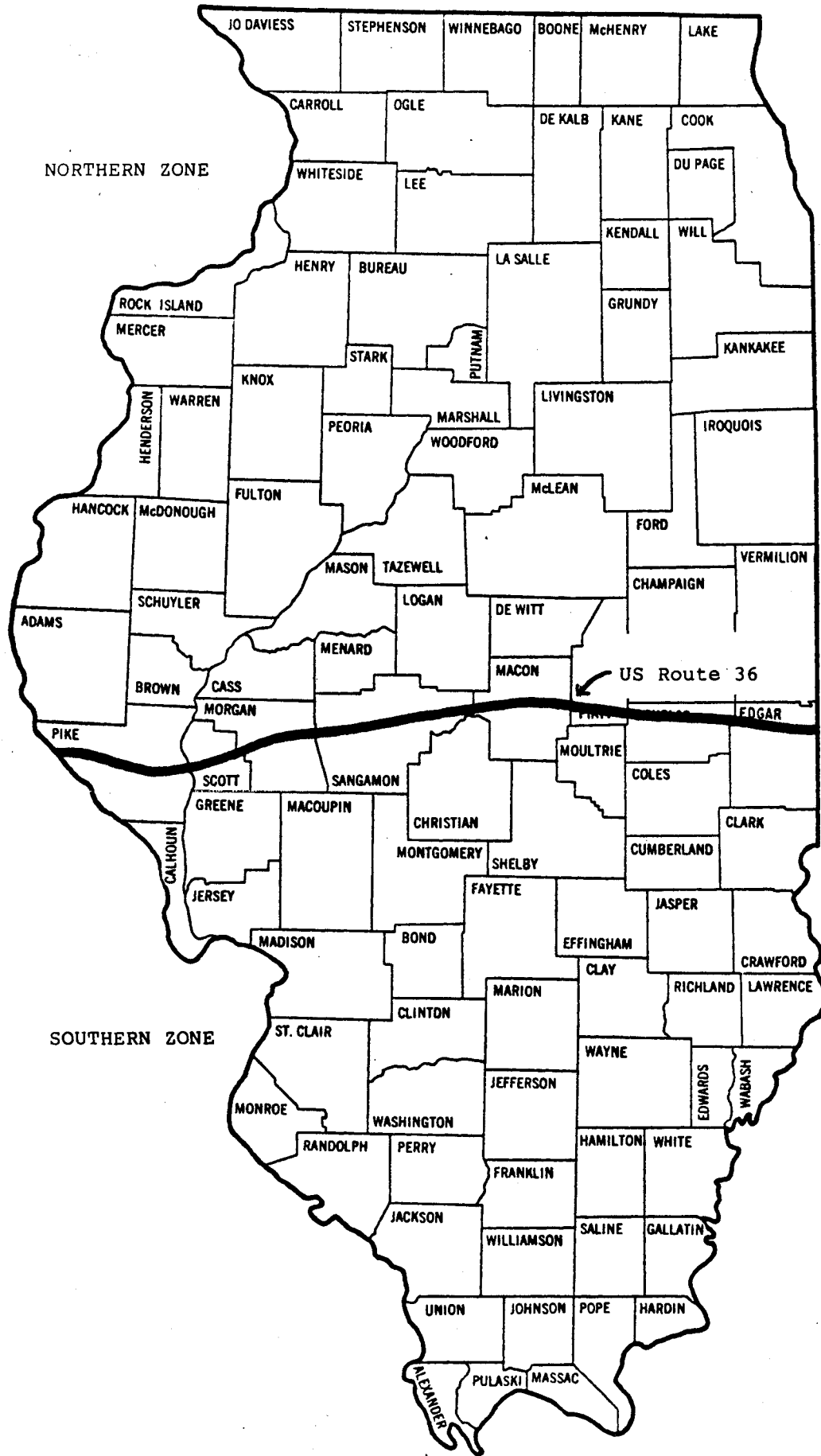
Figure 2. Furbearer management zones for the 1985-86 season.