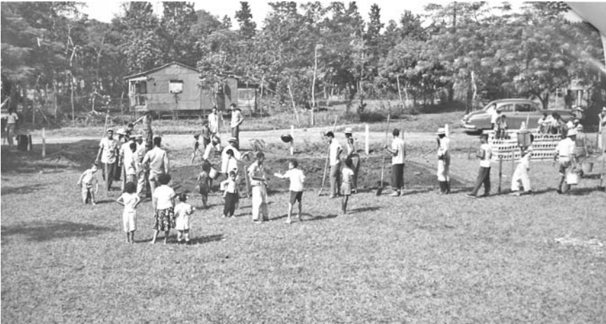
Construction of Maguayo's athletic field, 1955.