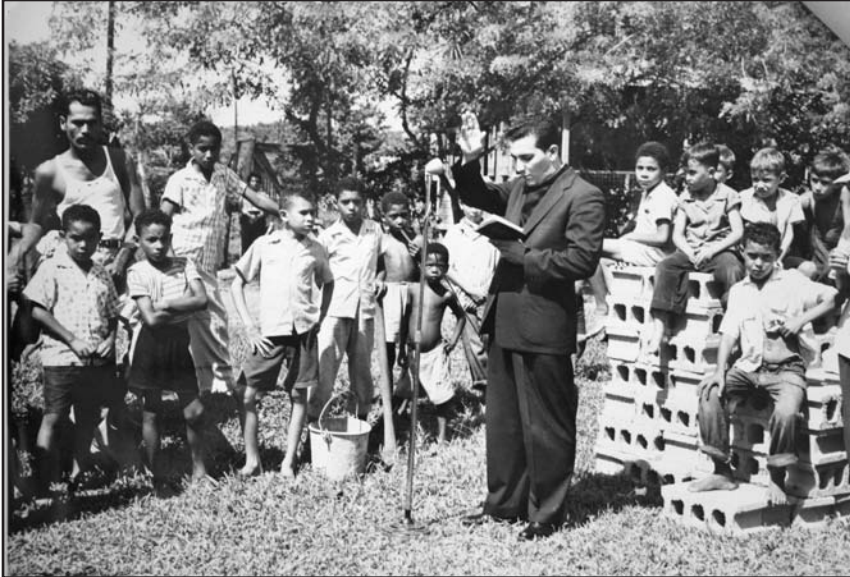
Local priest blessing the activity in barrio Maguayo, Dorado, 1955.