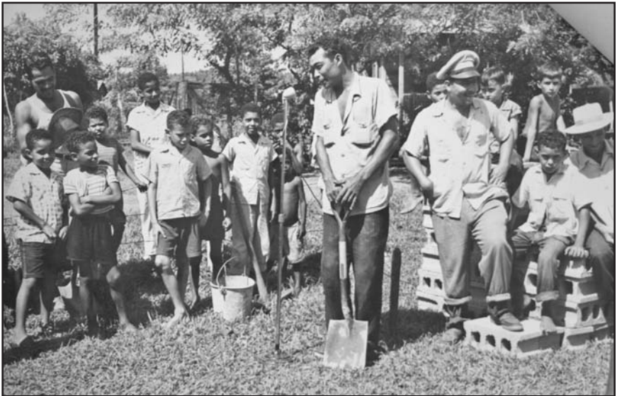
Construction of Maguayo's athletic field, 1955.