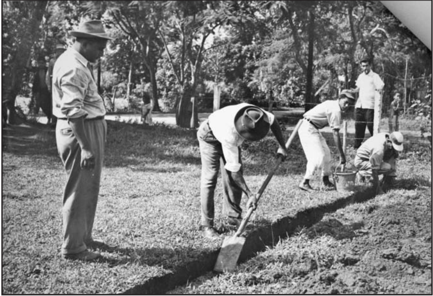
Construction of Maguayo's athletic field, 1955.