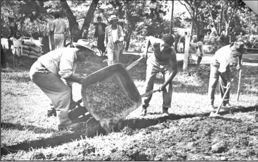
Construction of Maguayo's athletic field, 1955.