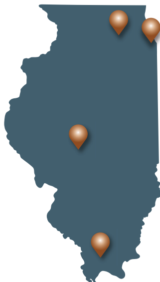
Figure 2: Location of teachers in the study

These financial strains were to be expected, in part, due to pandemic-related layoffs and the slowdown in the economy. Teachers’ partners or spouses may lose their jobs even if a teacher remains an “essential” worker. However, pandemic-related financial hardship has been a reality for many teachers, especially those in low-income areas of the state, where teacher salaries are also low. Furthermore, school paraprofessionals and other non-licensed support staff are often paid much less than teachers. Additionally, many teachers, who are primarily women, 19 are navigating the challenge of remote or blended teaching while shouldering the responsibility to care for their own families. 20 Despite recent efforts to