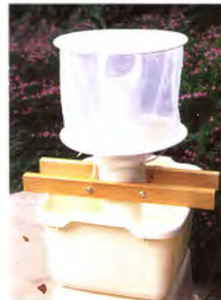
Gravid traps collect mosquitoes and their eggs for virus identification.