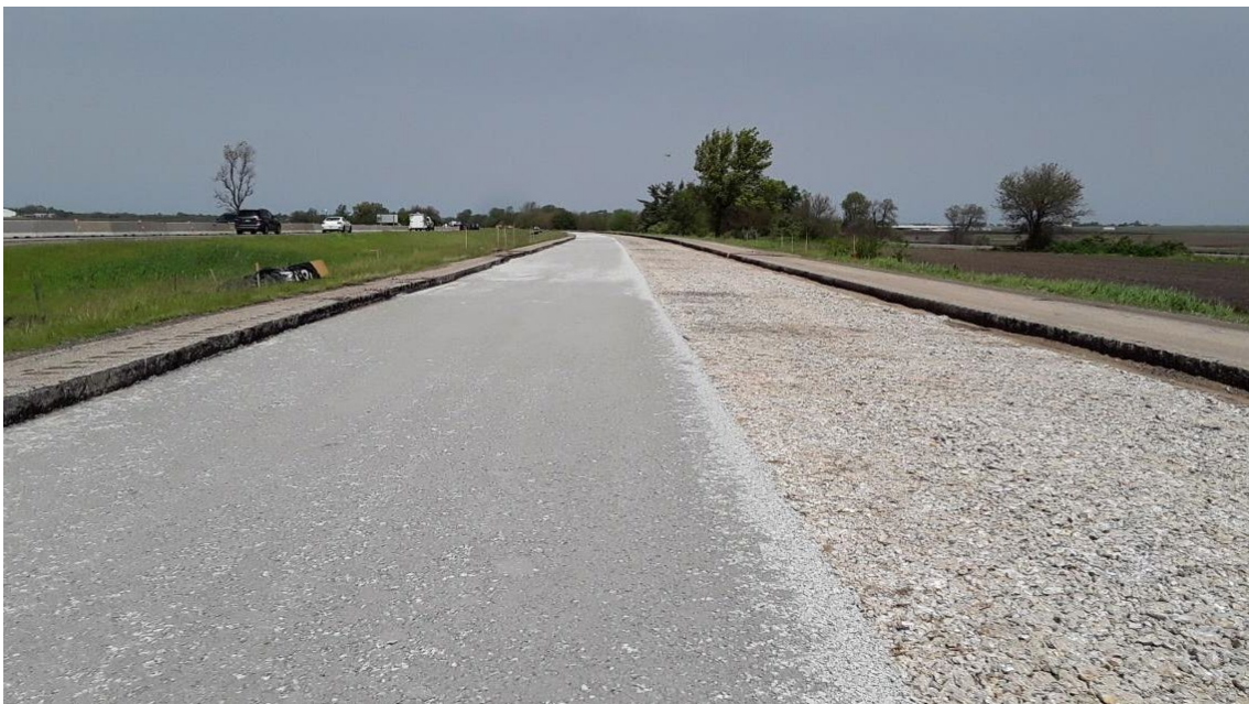
Figure 1. Photo. Granular subbase placed on passing lane vs. rubblized driving lane of I-74.

During a review of the bid plans, the project's staff noted that a Type A granular subbase, minimum Illinois bearing value (IBV) of 40, was to be utilized in many areas to achieve the required profile grade. A granular subbase over the rubblized CRCP has never been constructed on an IDOT interstate project. A previous project on I-55 in District 8 originally included a granular base, but the plans were amended prior to bidding and the granular base was eliminated. The granular subbase on the I-74 project was constructed per the original design. Figure 1 shows the resulting granular subbase during construction.