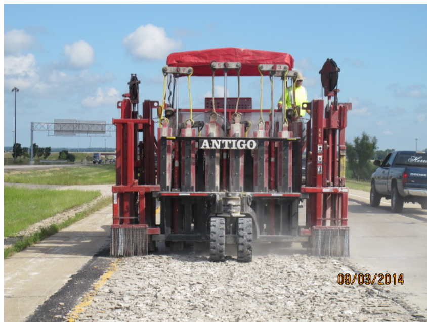
Figure 9. Photo. Version of multi-head breaker common on Illinois projects.

Illinois’ current rubblized design process not only determines the thickness of the HMA pavement, but also evaluates the supporting structure under the pavement to be rubblized. The result is that for areas with weak soils, the breakage equipment may be limited to the multi-head breaker. For stronger sections, the contractor is given the option between resonant breakers and multi-head breakers. Most Illinois rubblizing projects have utilized a multi-head breaker similar to the one seen in Figure 9.