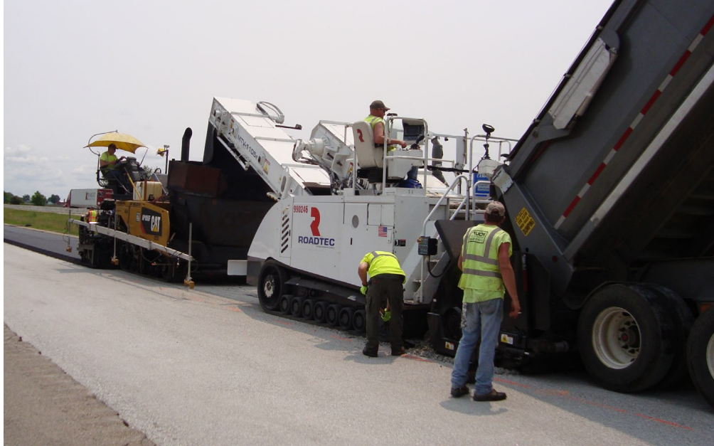
Figure 2. Photo. Paving train utilizing the RoadTec 1105e tracked material transfer device.