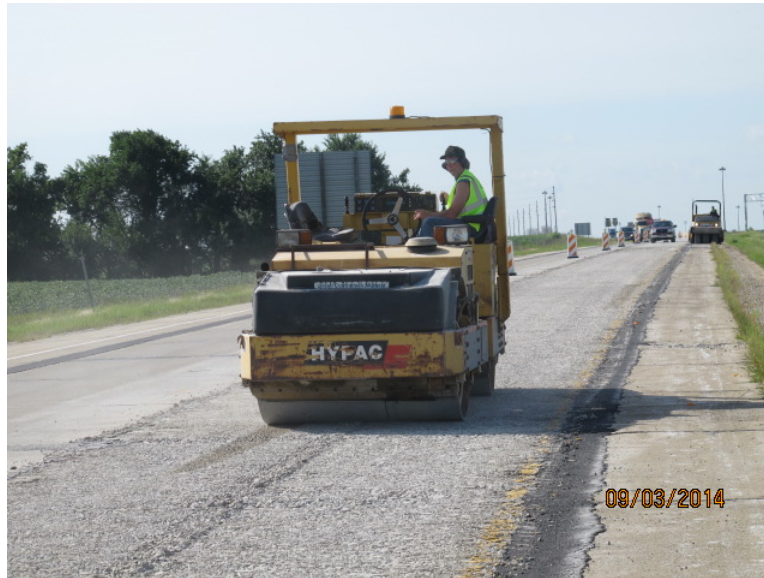
Figure 10. Photo. Final compaction of rubblized pavement with a steel wheel roller.

After pavement breakage, the surface is further conditioned with a “Z” patterned steel wheel roller, a rubber tire roller, and a steel wheel roller to prepare the surface for overlay. Figure 10 shows the final pass of the steel-wheeled roller before placing the HMA pavement directly upon the prepared surface. Note that a prime coat is deemed unnecessary and not used prior to HMA placement.