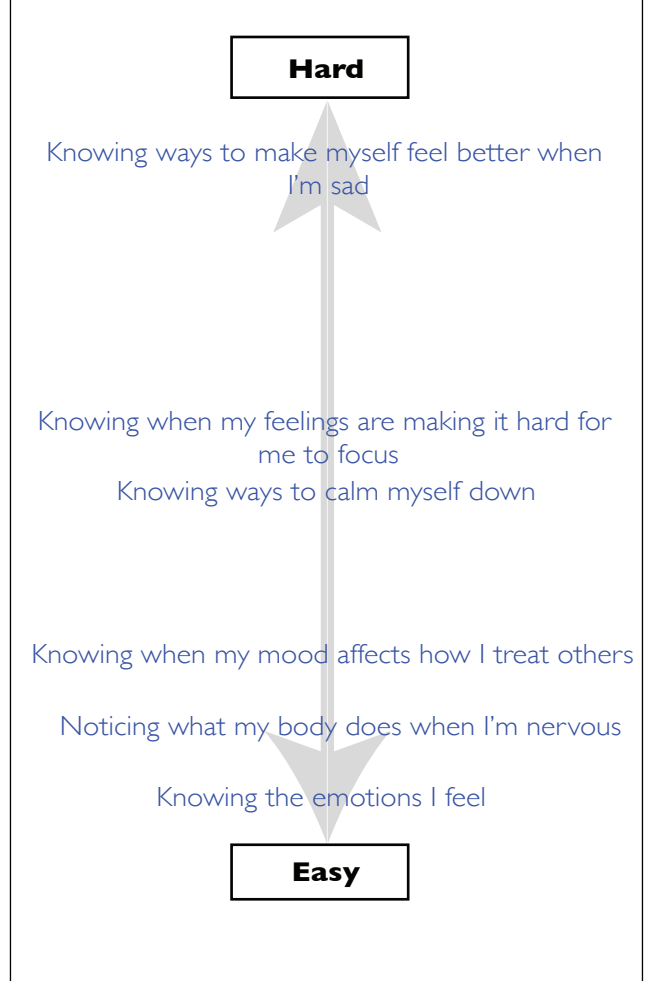
Figure 1: Self-Awareness of Emotion

order matched our expectations, as the three easiest items aligned with elementary-school-level standards and the three hardest items aligned with middle-school-level standards. The item content likewise reflects a theoretically-sensible hierarchy of skills, with the easiest items reflecting