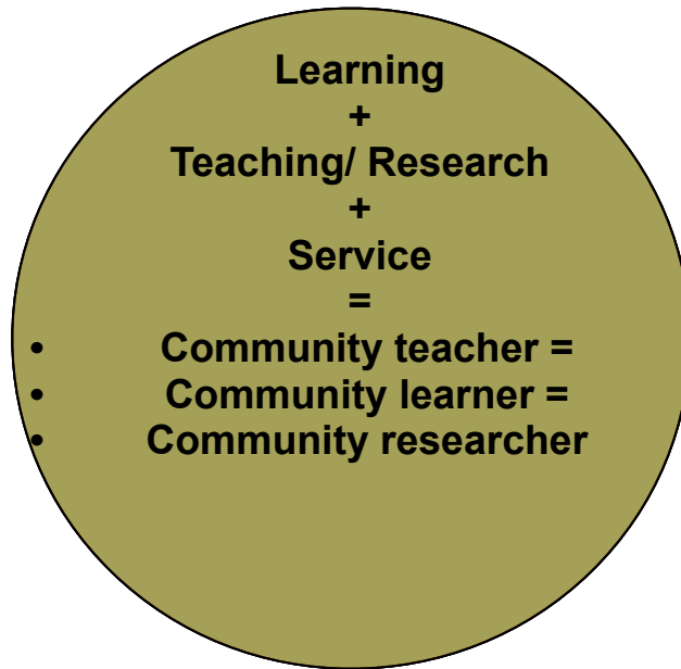
Figure 2. Community inquiry approach to service learning

The community inquiry model emphasizes the need to recognize education of as life. Teaching, research, change and learning are experienced by all community learners. Community learners document and reflect on their own experiences, becoming community teachers and researchers.