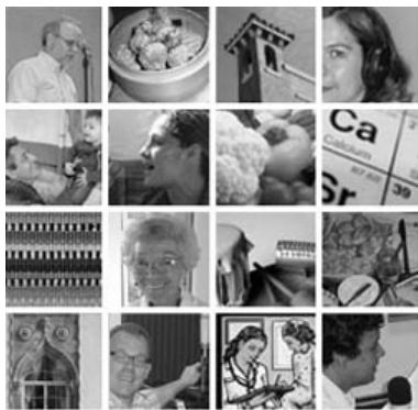
Spanish Language Radio Program

material is delivered in Spanish via radio and web podcasts that reach nearly one million listeners across the U.S. and in Latin America each week. The New Horizons program includes interviews with national and Latin American leaders, as well as health and culture sections. This program also supplements a Spanish oral comprehension curriculum for high school and university faculty who teach community-based learning pedagogies across the U.S. For the first time in its history, WILL will broadcast the program and has proposed airing emergency alerts in both Spanish and English, such as tornado and health warnings. WILL is also the new home of the New Horizons production studio.