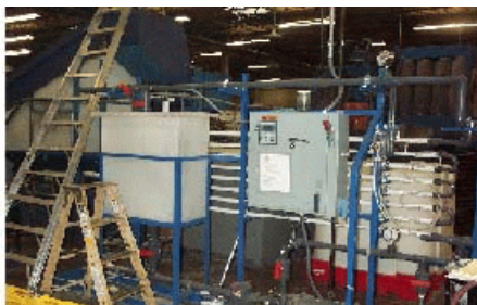
Werner Company UF system on deburring operation