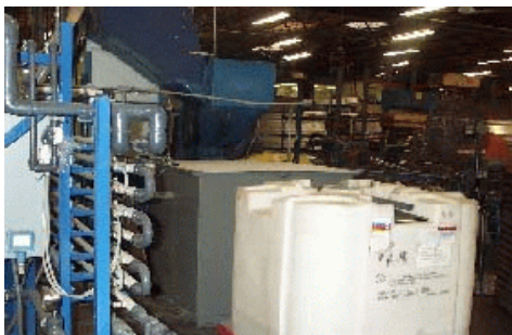
Werner Company UF system and process tanks on deburring operation