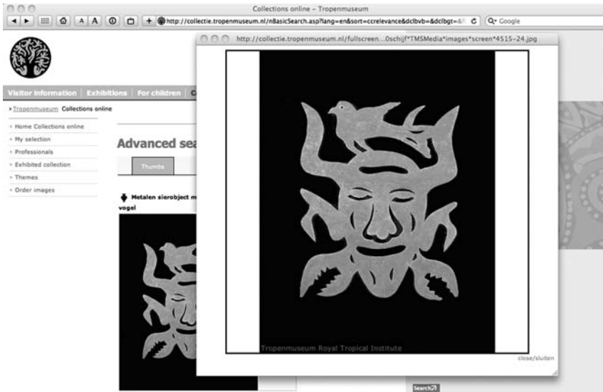
Figure 4. The same image as in figure 3, after clicking on the zoom button.