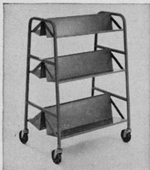
6-Shelf Model No. 176*