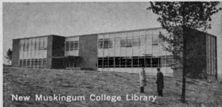
New Muskingum College Library

Muskingum is now engaged in a ten-year development program with the educational goal of meeting the needs of tomorrow's students. A major aspect of this program is the college's new library. This modern structure, planned for present and for increased future enrollment, provides complete study facilities and will house approximately, 120,000 volumes. Globe-Wernicke study carrels, desks, steel book stacks, and other high quality library equipment are part of this library.