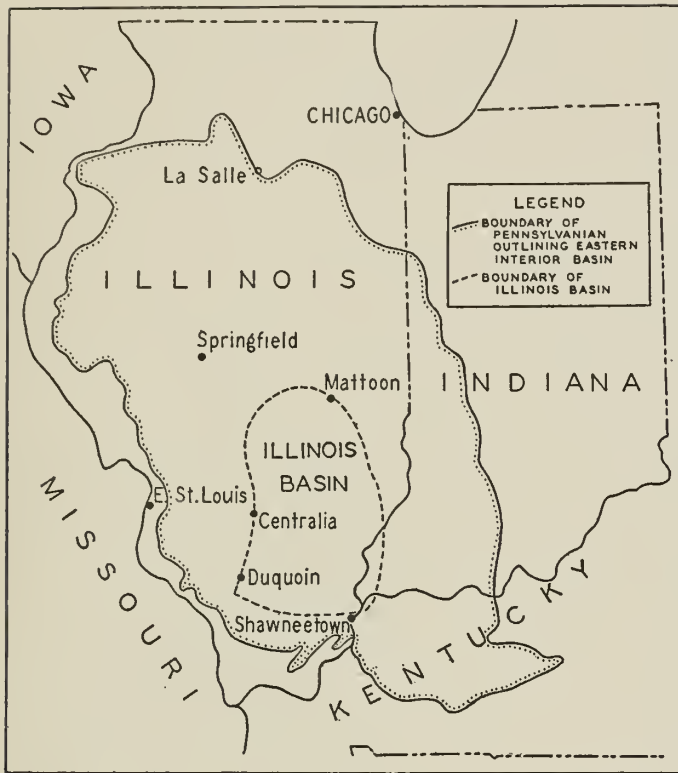
FIG. 1.—Index map of the Eastern Interior basin and of Illinois basin (deep part of Eastern Interior basin).