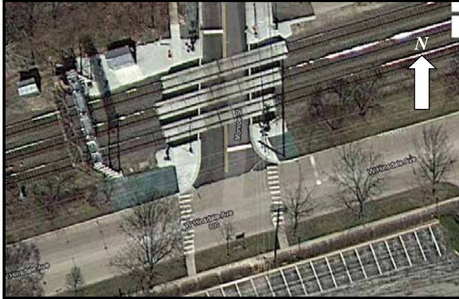
Figure 1. Top view of selected grade crossing on Monroe Street.

The railroad grade crossing on Monroe Street in Hinsdale, Illinois, near the intersection with Hinsdale Street was selected for this evaluation. At this crossing, three railroad tracks intersect a two-lane, two-way street. The tracks are part of the BNSF network and carry both freight and passenger trains, while the roadway carries a relatively low traffic volume and is located near a T-intersection at the south end of the crossing. A top view of the crossing is shown in Figure 1.