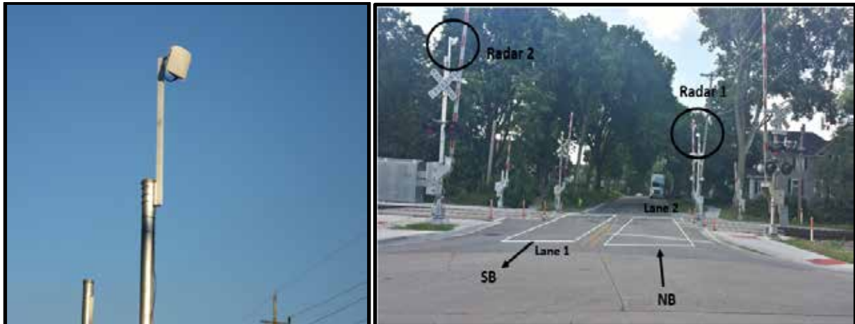
Figure 3. Detail and numbering of microwave radar units and traveled lanes.

The radar system detection was set such that each radar unit generated a single output per lane, covering an area similar to that from the loop detectors. This arrangement resulted in a total of four outputs for the two radar units: Radar1–Lane1, Radar1–Lane2, Radar2–Lane1, and Radar2–Lane2. An illustration of the numbering used for the radar units and the traveled lanes, is shown in Figure 3.