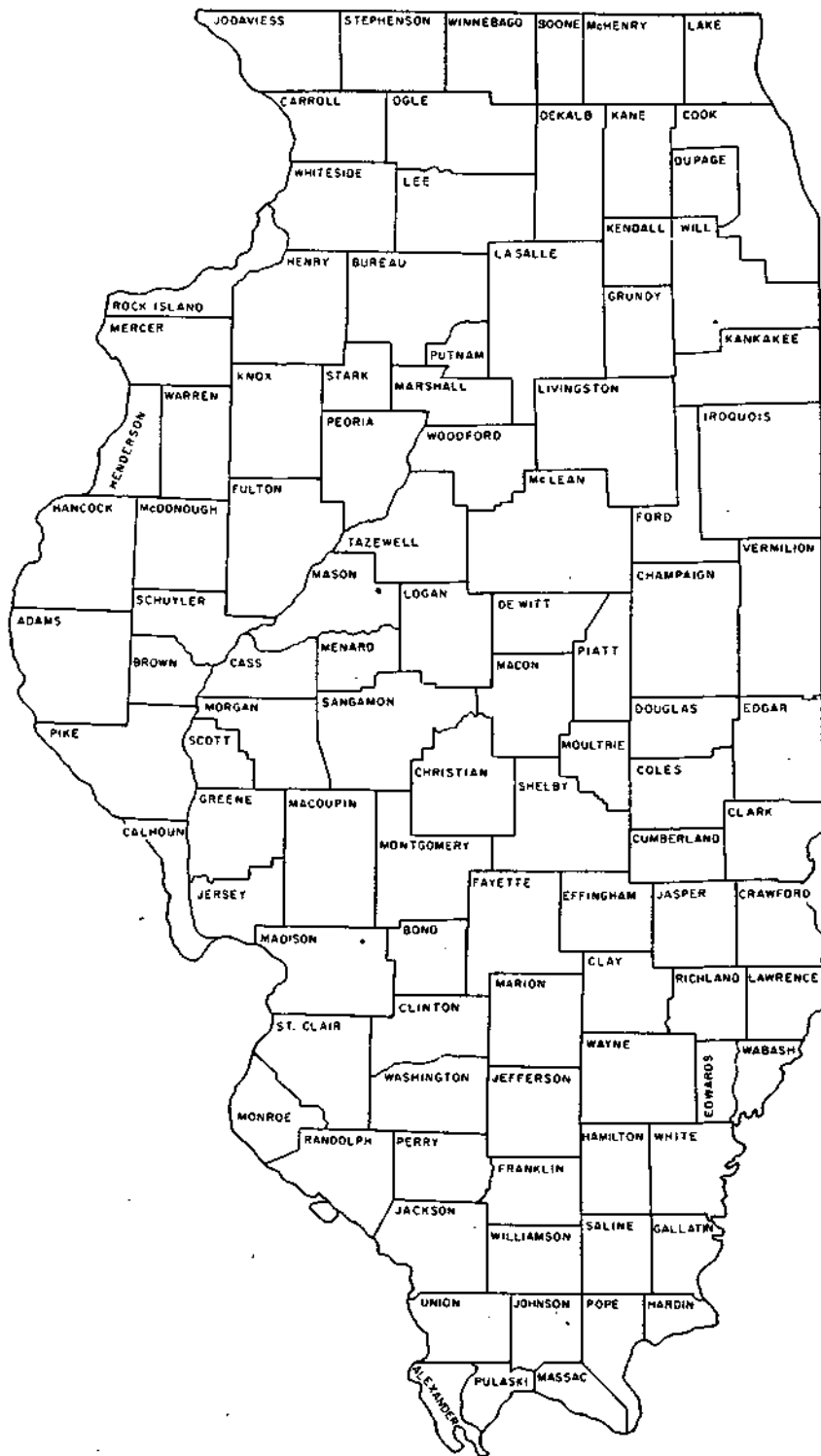
Location of Counties in Illinois