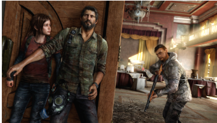
Figure B: The Last of Us : Joel protects Ellie.

If Clementine or Ellie is killed, you are presented with a graphic representation of agonizing screams and painful death. In both situations, paternal masculinity is all about protecting the daughter. The paternal figure must succeed at performing violent behavior to protect his daughter for the story to continue.