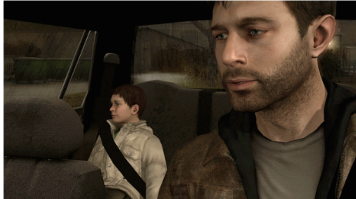
Figure A: Heavy Rain : In the first game sequence after Jason's death, Ethan drives Shaun to his apartment. Image found on publisher's official website.

And even if you manage to perform well as a father in the next sequence at the park (earning some relieving laughs and smiles from Shaun), Shaun says, “Sometimes I wish everything could just be the way it was before” (Quantic Dream). No matter how well you perform at these mundane actions of fatherhood, you fail to bring happiness back to the family and reclaim Ethan’s identity as a good father.