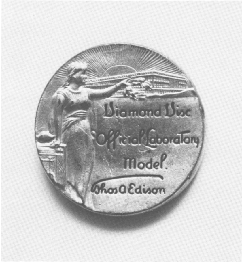
SEAL—EDISON OFFICIAL LABORATORY MODEL PHONOGRAPH

passed the ultimate test of successful public comparisons of commercial discs with the live artists. It is time to combine this kind of idealism with our marvelous technology and begin again to deliver truth in audio!