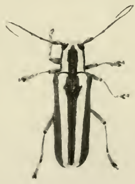
Fig. 2.—Adult beetle of the roundheaded apple tree borer. Its body, covered by a dense mat of flattened hairs, appears silvery white in color except for three longitudinal brown stripes on the back.