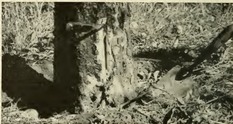
Fig. 4.—The knife blade indicates the height, about 6 inches above the base of the tree, at which a borer larva was found in tunnel. Larvae move up or down the trunk from the point of entrance near the base of tree.

In addition to securing data on kill of larvae, we made examinations for immediate injury to trees and kept the orchards