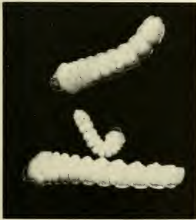
Fig. 1.—Larvae of the roundheaded apple tree borer. The damage is done by this borer in the larval stage. The larva is usually 1\frac{1}{4} inches or less in length and is white except for a dark brown head.

The roundheaded apple tree borer, Saperda candida Fabricius, figs. 1 and 2, tends to be more localized than some other major apple pests. It may be very serious in one orchard and not found at all in an adjacent one. Growers have observed that it is frequently confined to some one part of the orchard, especially if that part is near woods in which are growing service berry or shadbush, haw and other wild host plants related to apple. In such situations many trees are greatly weakened or are killed.