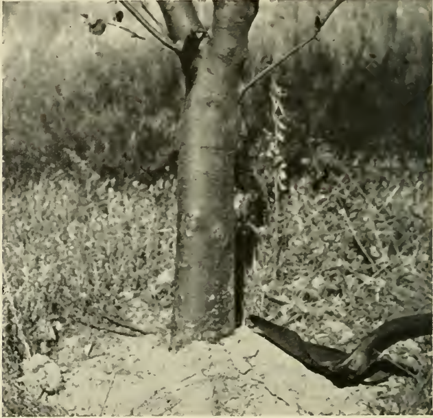
Fig. 6.—Tree mounded after application to base of tree of one-half pint of PDB in Dendrol and water.

Experiments have shown that a soil temperature of 55 degrees F., at 1 inch below the surface, is about the lowest at