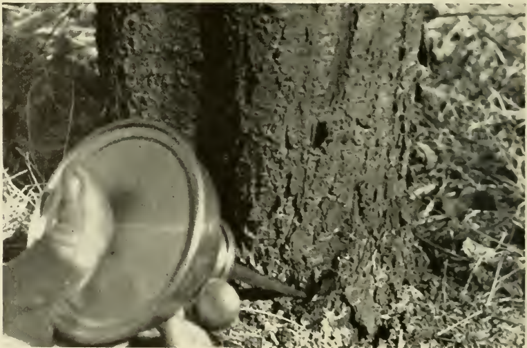
Fig. 3.—Oil-can method of injecting carbon bisulfide into burrow of the roundheaded apple tree borer. The location of the burrow near the base of the tree is indicated by whitish or brown frass.