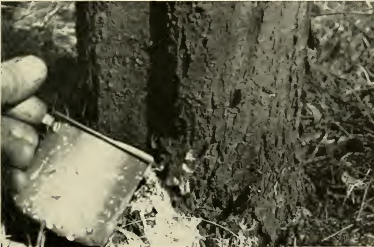
Fig. 5.—Method of applying one-half pint emulsion of PDB, Dendrol and water to borer entrance at base of tree.

We have made no extensive investigation concerning the best time of year for applying the mixture of PDB and Dendrol ,