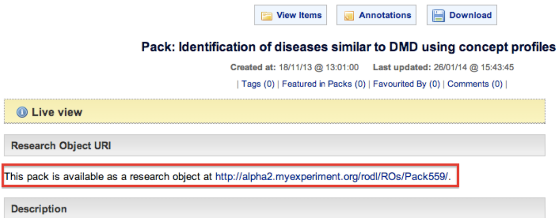
Fig 2. Screenshot of existing RO generation via myExperiment Alpha2.

It is possible to generate an RO from a pack using existing tools and infrastructure. myExperiment Alpha 2 already implements an RO API developed by the Wf4Ever project to generate ROs from myExperiment packs (Fig. 2). Alpha 2 is still in development. The Research Object Digital Library ( www.rohub.org ) has deployed a more complete implementation of the RO API and samples were taken from that library to test DataBank ingest of ROs. Therefore, it is possible that there may be slight differences for myExperiment ROs.