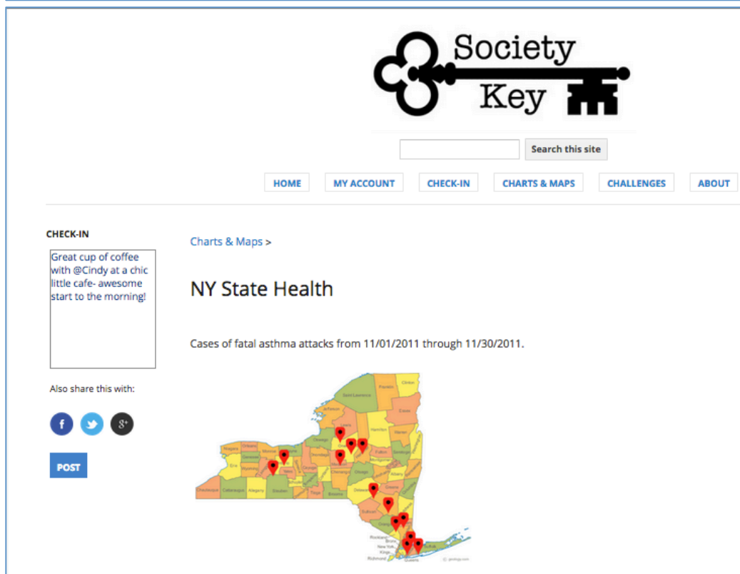
Figure 2: Society Key website snapshots showing examples of the “Check-In” and “View Charts and Maps” features where users can log in, link up with their social media accounts and a variety of government open databases, then create, view, and manage their data visualizations. The prototype website is available at: http://goo.gl/VBTwDm .