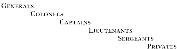
Figure 2. Tree: Chain of Command in the Army.

Trees. Another type of classificatory structure used to represent entities and their relationships is a tree. A tree divides and subdivides its classes based on specific rules for distinction just as in a hierarchy but does not assume the rules of inheritance. Thus, in a tree, the entities have systematic relationships but not the generic (is-a) relationship. There are many types of relationships that can be represented by a tree (see, for example, Figure 2).