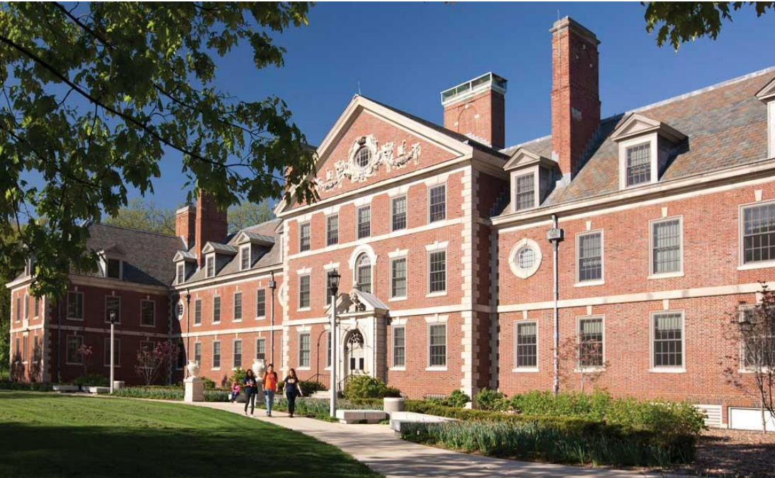
McKinley Health Center