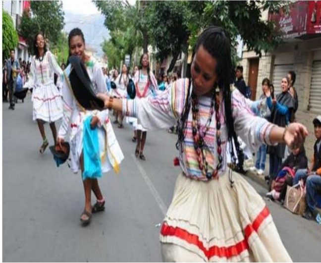
Figure 2: Female sayeras

embroideries sewn into them. This is the standard for both men and women’s clothing [see figures 2-3]. Various articles of Saya clothing follow this standard including ponchos, skirts, pants, and shirts. This multicultural rooted clothing has largely become the standard for Saya performers today.