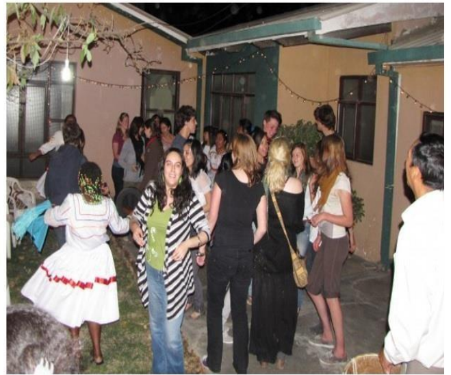
Figure 5: Spectators engage with sayeros