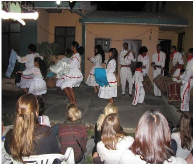
Figure 4: A group of spectators observe a Saya performance