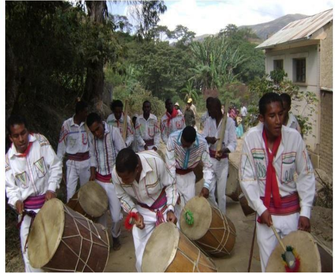
Figure 3: Male sayeros

As mentioned earlier, the Saya is constantly changing. As an expression of Afrobolivian grievances and triumphs, the lyrics are created and recreated on a song by song basis. In recent years, Saya performers have adopted a tradition of paying homage to Manuel Isidoro Belzu who is considered a hero in the Afrobolivian community for liberating the Afrobolivians from slavery. Therefore, sayeros celebrate Belzu’s memory by beginning most of their songs with the phrase “Isidoro Belzo Bandera ganó/ Ganó la bandera del altar mayor” (Isidoro Belzu won our freedom/ He won the highest altar.) As Saya is a “living” art form, there are many different songs that are created every day. The Saya songs of today mostly reflect pain, sadness, political/social issues, protests, and other issues of concern to the black community. The