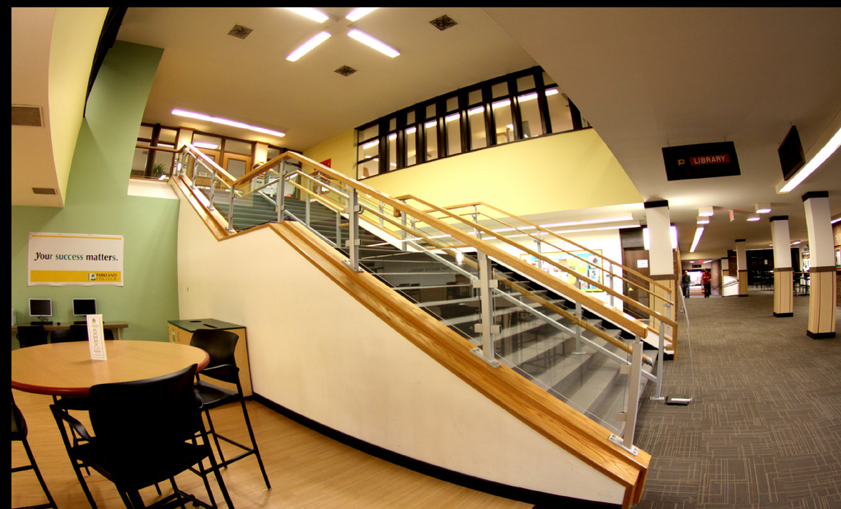
Parkland College Library