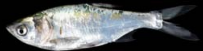
SILVER CARP Juvenile