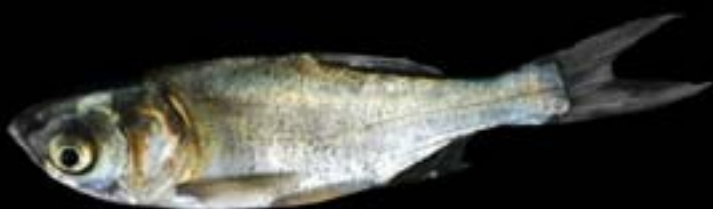
BIGHEAD CARP Juvenile