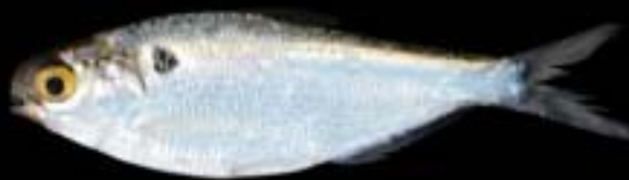
GIZZARD SHAD [NATIVE] Juvenile