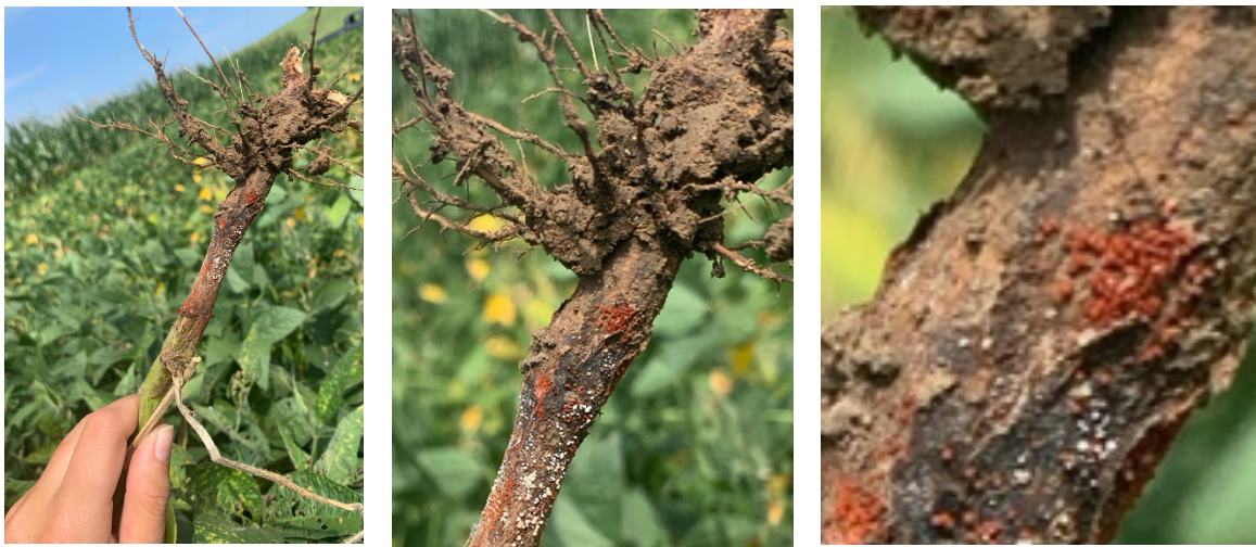
Fig. 2.2. Red perithecia on base of soybean plant. (Right picture courtesy of Nathan Kleczewski).