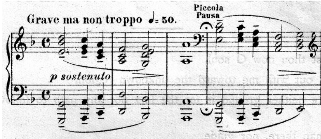
Ex. 3.8: Vaughan Williams, Toward the Unknown Region , mm. 1-5 (reduction)

Thus the theme of the wanderer present in the songs, and connected with the search for knowledge of the past in the last chapter, finds another outlet in a group of works related in various degrees to life's future prospects. 176