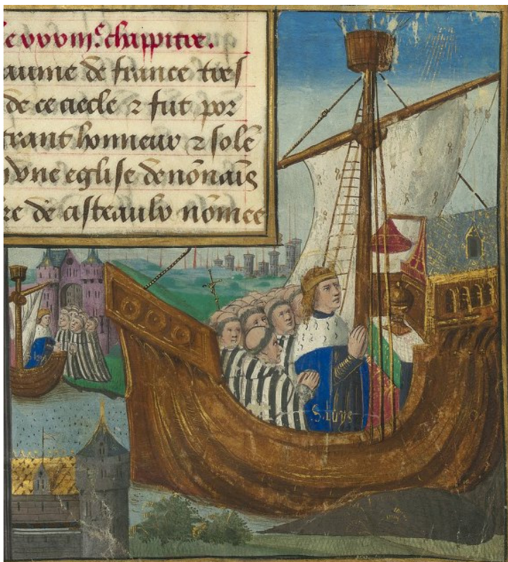
Figure 5. Detail of Figure 1.