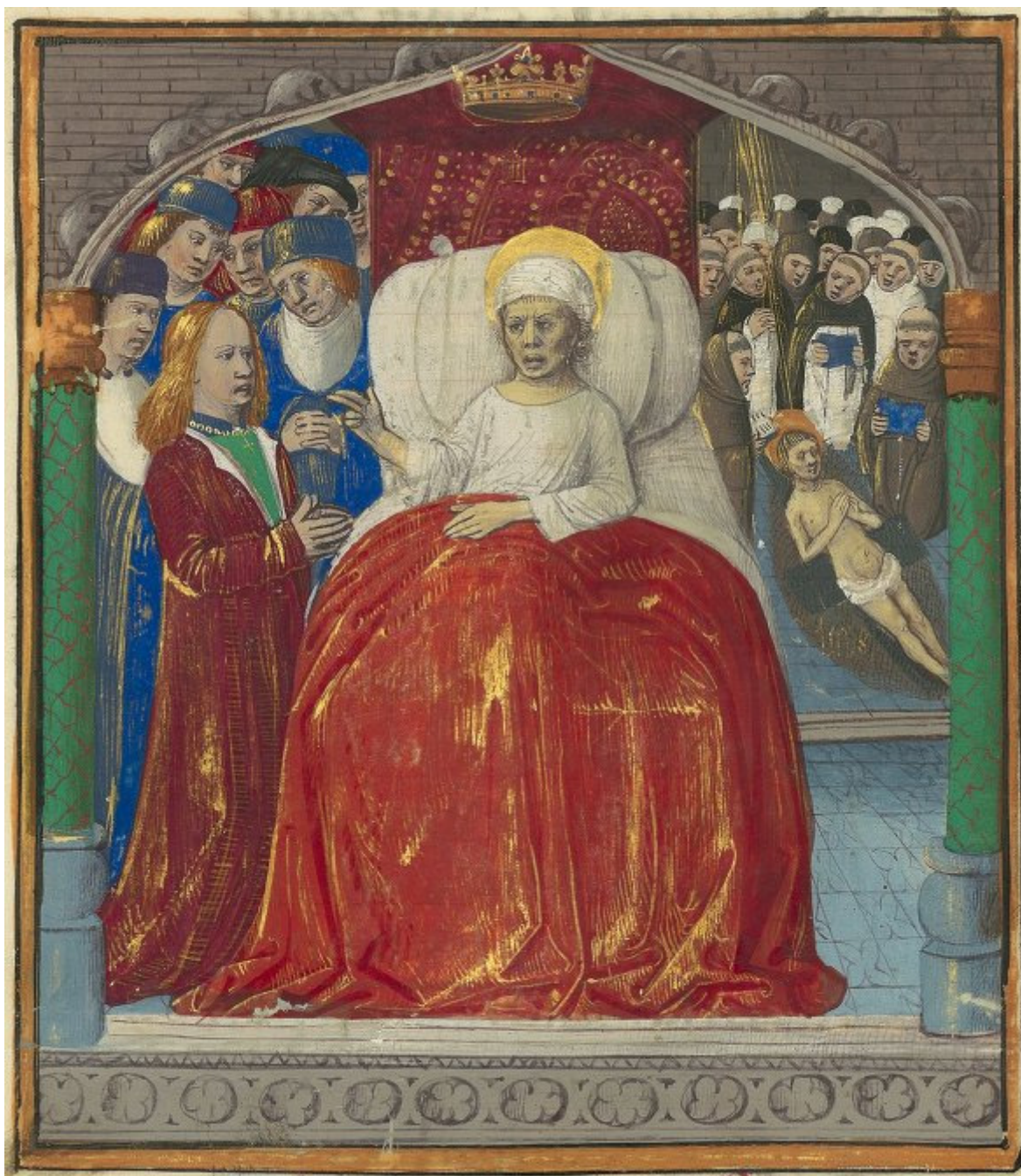
Figure 9. Detail of Figure 8.