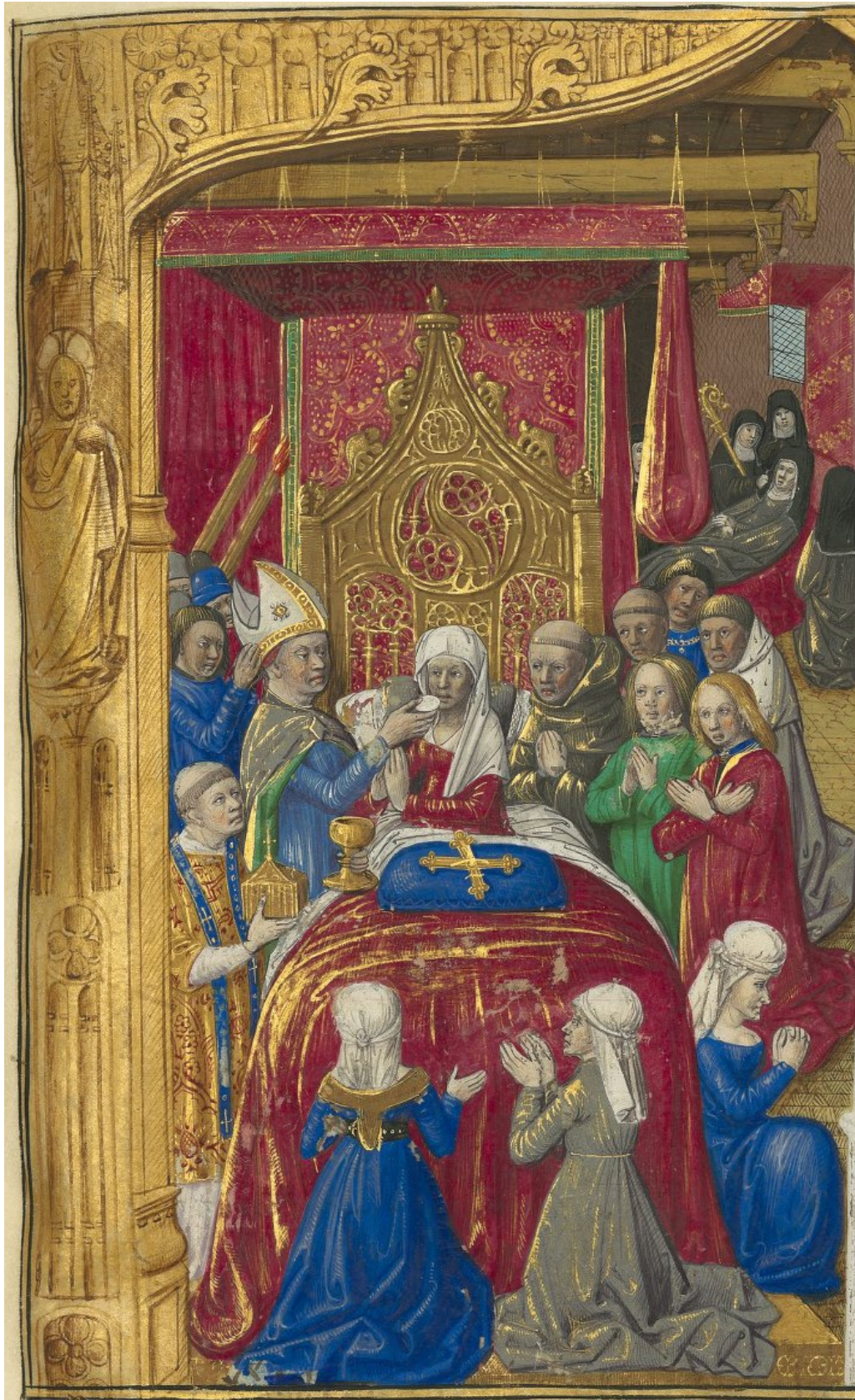
Figure 2. Detail of Figure 1.