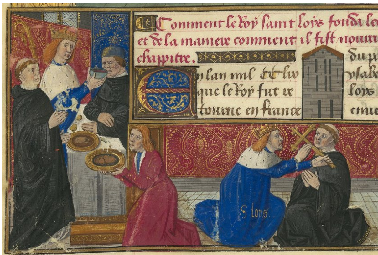
Figure 13. Detail of Figure 10.