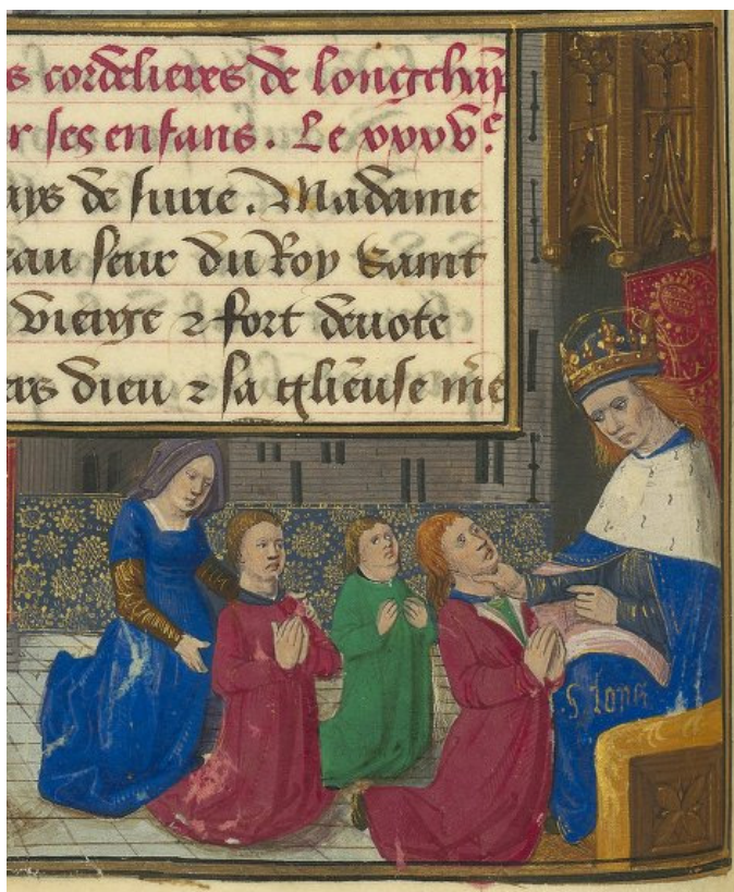
Figure 14. Detail of Figure 10.