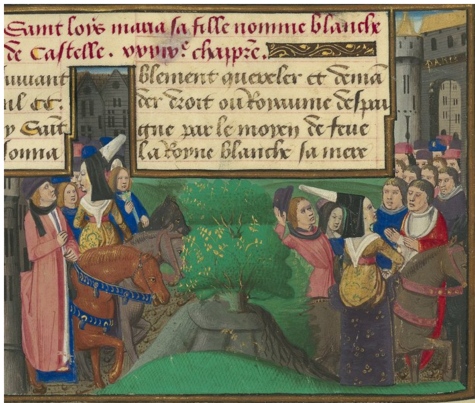
Figure 18. Detail of Figure 15.