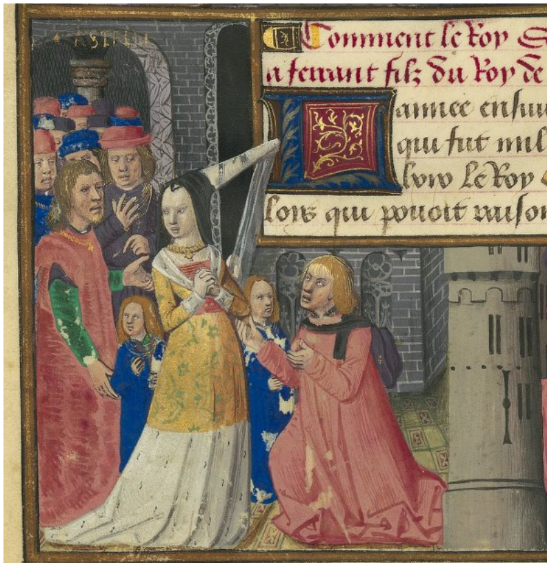
Figure 17. Detail of Figure 15.