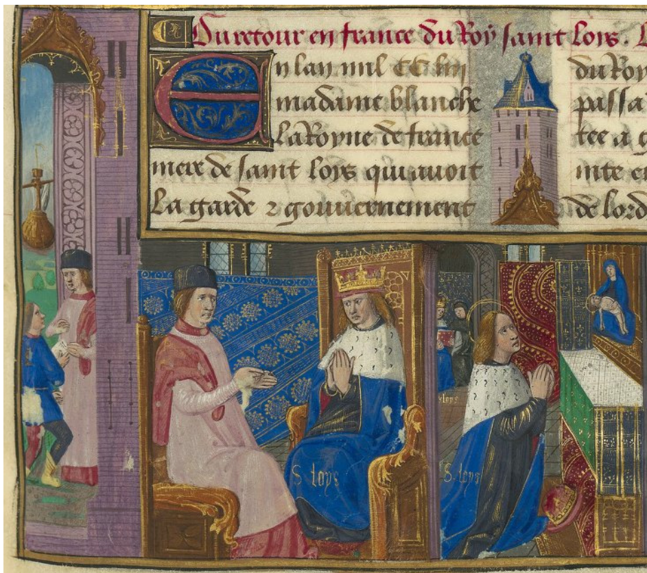
Figure 4. Detail of Figure 1.