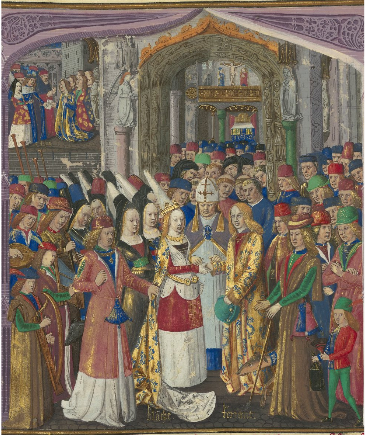
Figure 16. Detail of Figure 15.