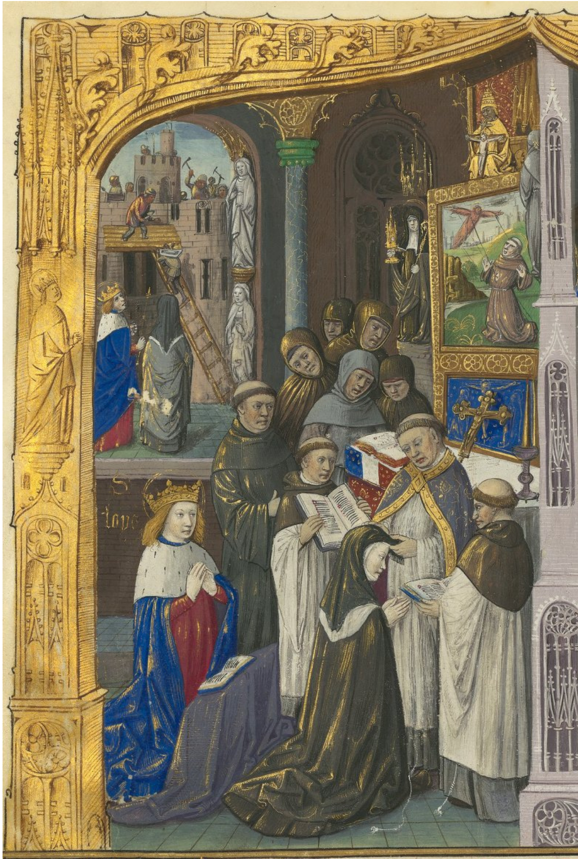
Figure 11. Detail of Figure 10.