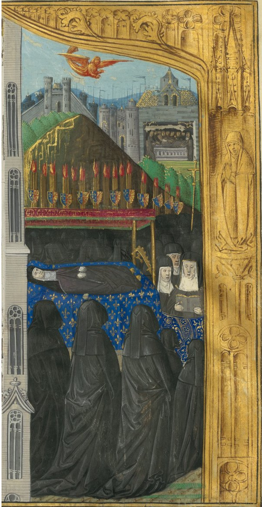
Figure 3. Detail of Figure 1.