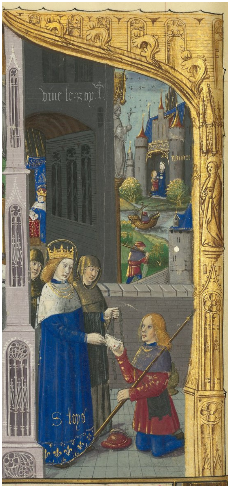
Figure 12. Detail of Figure 10.