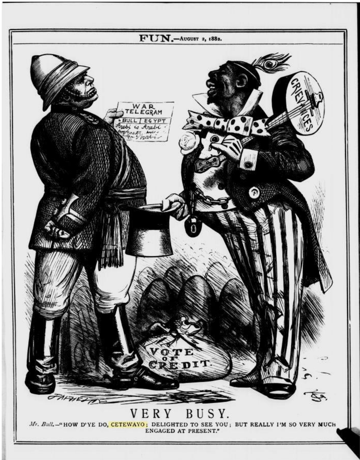
Figure 2, "Very Busy: A Duet In Black and White," Fun , August 2, 1882.