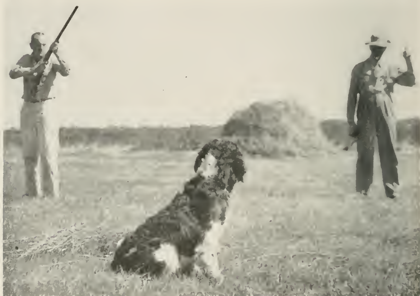
Teaching a Springer Spaniel steadiness to shot. Spaniels are trained to sit when they spring game and to remain in this position until sent to retrieve or resume hunting.

fields, but before you have unsnapped the leash, grasp him by the collar and tail, putting him in pointing position, at the same time giving the command "Whoa." Since he will be anxious to be off, he will probably stiffen to a point. Repeat this procedure at the start of each trip until he has learned to remain quiet in