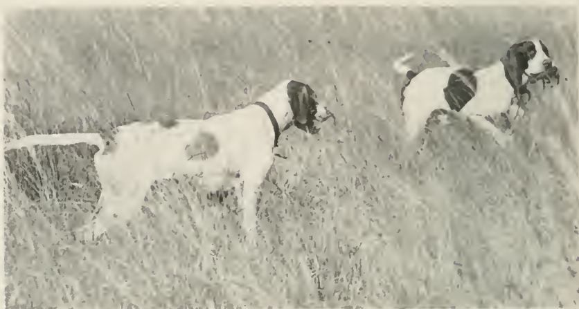
The leading Pointer has just retrieved a quail and is holding it in his mouth while he points another bird. The well-trained companion is honoring his brace mate's point.

Spaniel, Irish Setter, Chesapeake Bay, Labrador, and Golden retrievers. The Brittany Spaniel, Gordon Setter, German Shorthaired Pointer, and American Water Spaniel are fairly well known. The Cocker Spaniel is probably the most popular of all family dogs, but is used much less for hunting in Illinois than the Springer Spaniel. Although most people know the Irish Water Spaniel, it is overshadowed by some of the better known breeds of retrievers and ranks as one of the rarer hunting dogs in this state. The other bird dogs are rare or known to but few Illinois hunters. The rarity of these breeds in no way detracts from their merit.