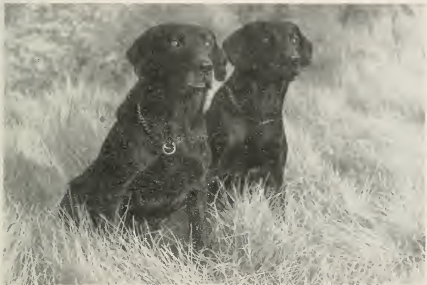
A pair of champion Labrador Retrievers owned by an Illinois sportsman. Field trials stimulate the improvement of the bird-dog breeds.

"It seems to me that field trials emphasize both speed and range too much, for while both are worthy of attention, they are