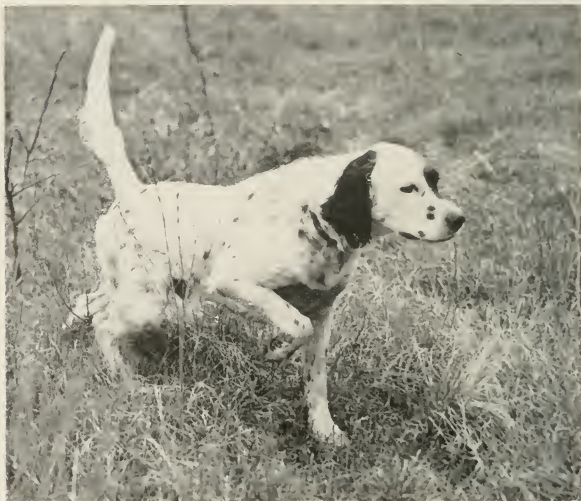
An English Setter points a covey of quails. The many setters, pointers, and spaniels trained to retrieve game help to reduce crippling losses among upland game birds.

As the puppy develops and learns to take directions, you should become accustomed to giving them in a firm, distinct voice, making sure that each command is understood and carried out. The commands should be short, and the same words should