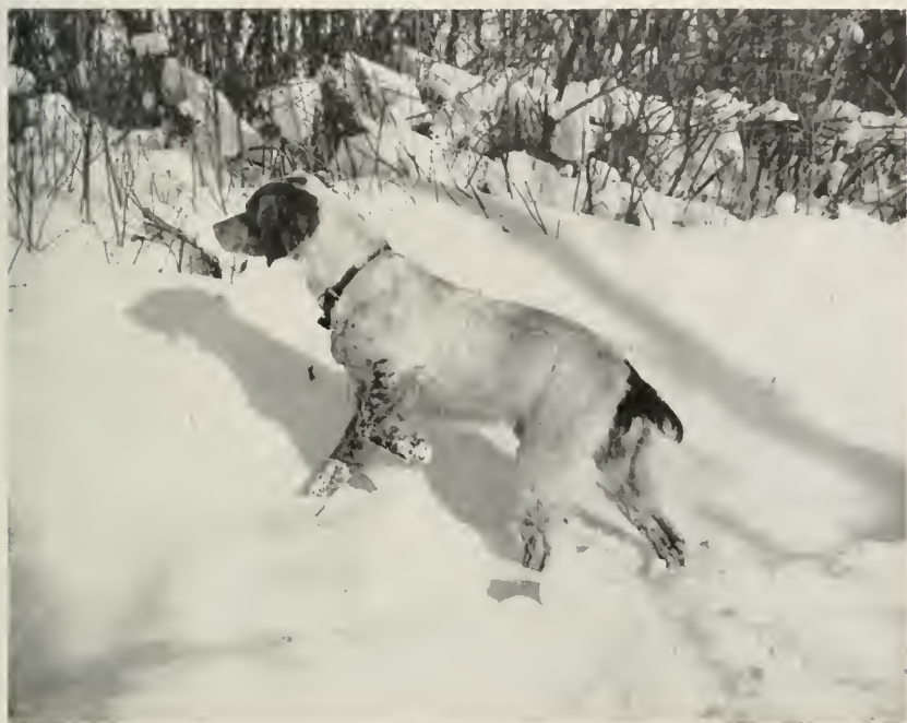
This Brittany Spaniel's tense point marks the hiding place of a pheasant in a snow-covered thicket.

"1. Keep the dog's head off from the ground; never let him develop into a trailer. The best method found by the author has